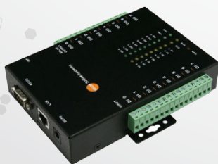
Inputs / outputs control TOR, USB, RS232