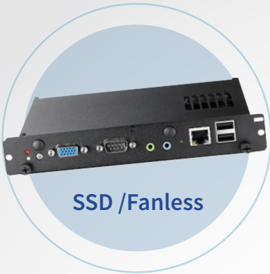
SSD / Fanless

A communication platform with many advantages